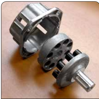
Integrated elastic joint, for best pump coupling (except model 1211).